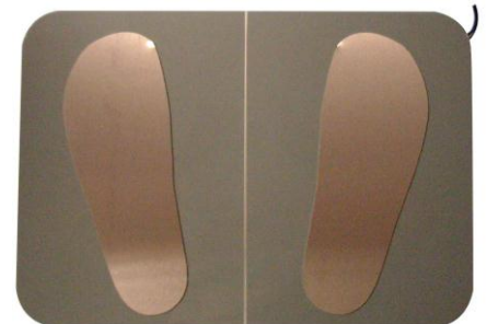
Picture: Footwear electrode for separate shoe testing (350 x 500 x 8 mm)